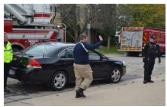
Cam waves to the onlookers showing he's ok