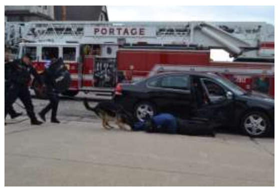
Arrest team approaches Suspect #2