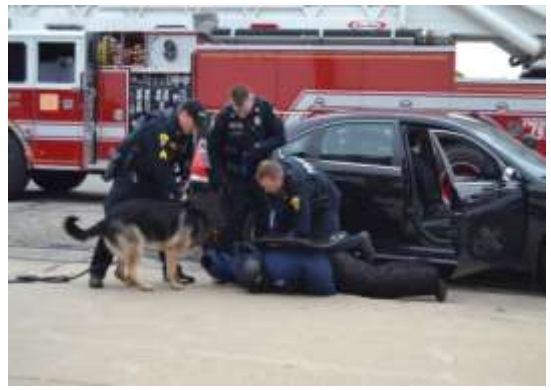
Suspect #2 safely detained