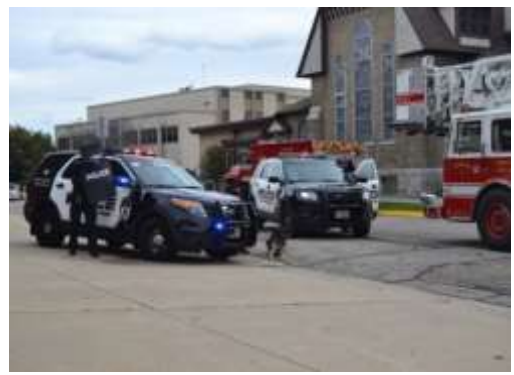
Suspect vehicle is stopped