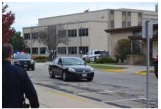
High risk traffic stop begins