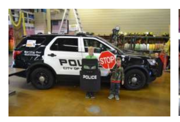
A Police Officer and a Crossing Guard!