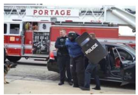
Suspect #2 patted down for weapons/taken into custody