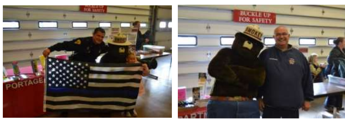
This little girl won the "blue line" flag