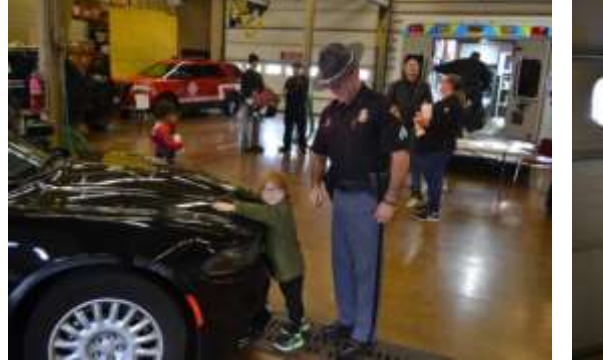
This little guy "assumes the position" as he's about to be arrested (by his dad!)