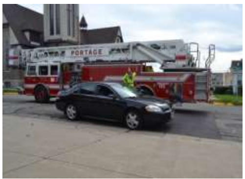
Kevin – suspect #1 - is cooperative & complies with orders