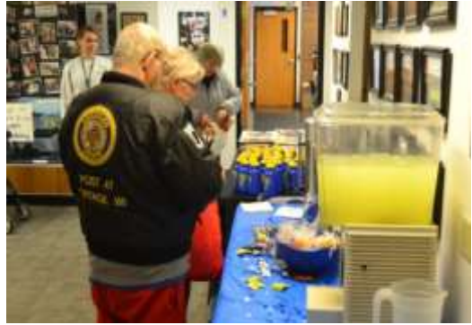
Citizens were treated to lemonade and other goodies