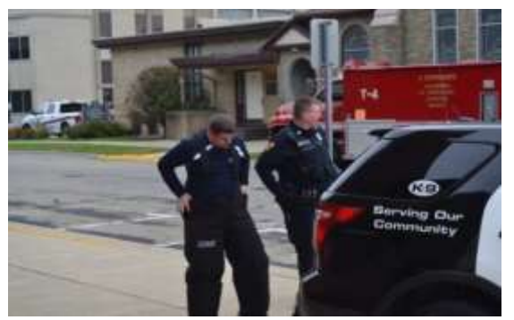
Cam – Suspect #2- removes "bite suit"